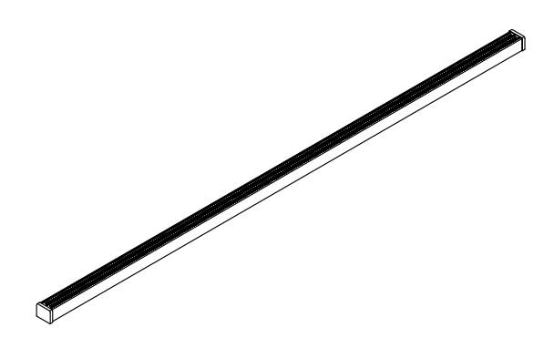
Codes/Standards ASME A112.18.2/CSA B125.2

Mounting feet Stainless steel lift key Universal Hardware Kit