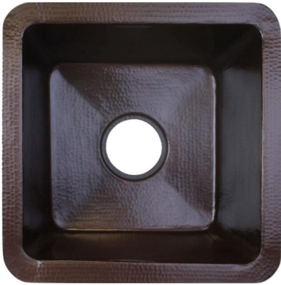
Shown in DB